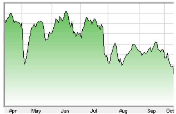
■ NCR CORP NEW as of 10/12/2018