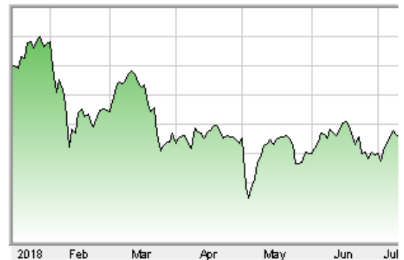
■ NCR CORP NEW as of 7/16/2018