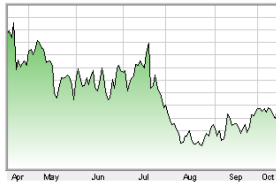
NCR CORP NEW as of 10/17/2017