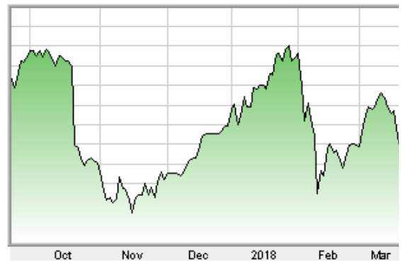
■ NCR CORP NEW as of 3/22/2018