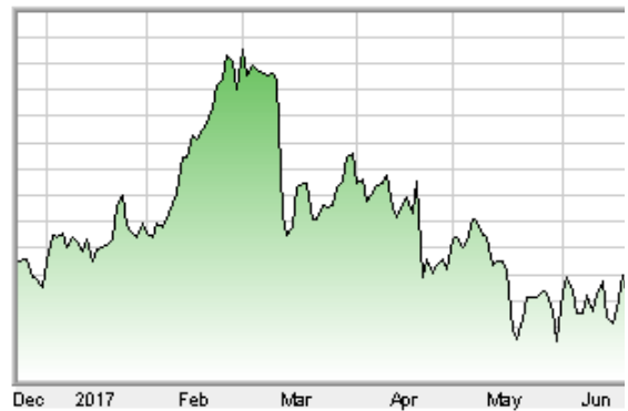
■ NCR CORP NEW as of 6/22/2017