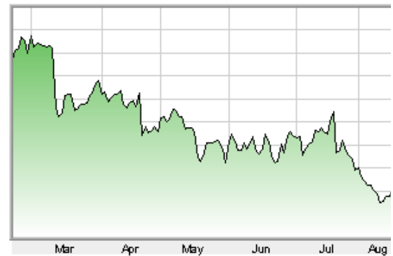
■ NCR CORP NEW as of 8/18/2017