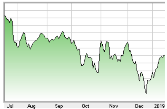
■ NCR CORP NEW as of 1/18/2019