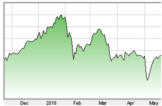
■ NCR CORP NEW as of 5/22/2018