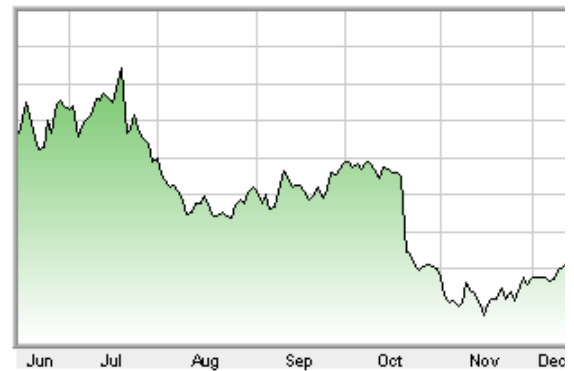
■ NCR CORP NEW as of 12/15/2017